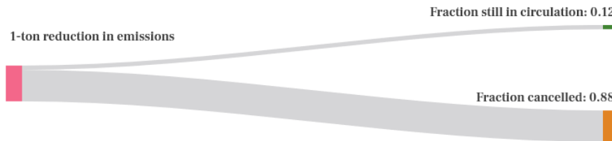
Figure 2. Outcomes in 2030 of a 1-marginal-ton reduction in 2024